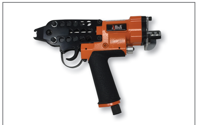
PNEUMATIC HOG RING GUNS