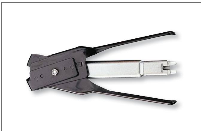
HOG RING PLIERS