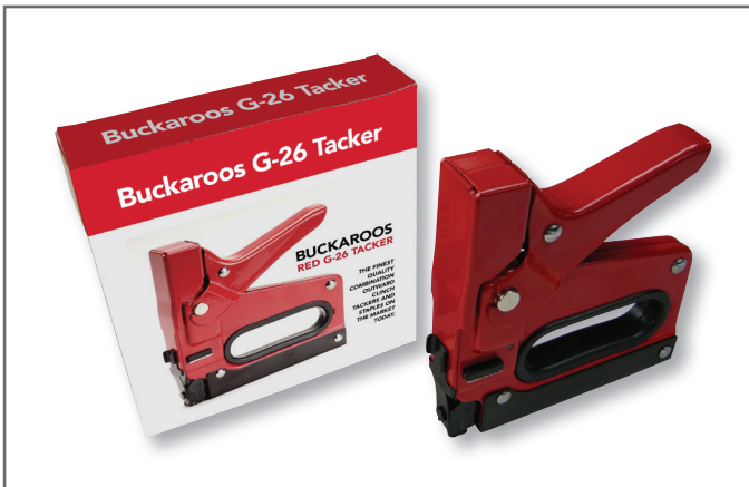
BUCKAROOS OUTWARD CLINCH TACKERS

FASTENERS FOR THE INSULATION & HVAC CONTRACTOR