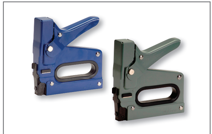
MARKWELL OUTWARD CLINCH TACKERS