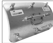
LRADUL - Round UL Door