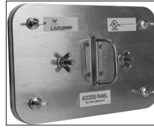
LADUL - Flat UL Door