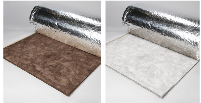
Color of product will differ depending on manufacturing location.

NORTH AMERICAN AVERAGE 14% POST-CONSUMER RECYCLED CONTENT ACTUAL RECYCLED CONTENT WILL VARY